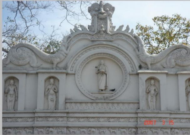
Sanghamitta Shrine, Kelaniya, Sri Lanka

Between the 11 th and 14 th centuries CE both the Bhikkhu and Bhikkhuni Sanghas died out in India and Sri Lanka due to invasions, war, and famine.