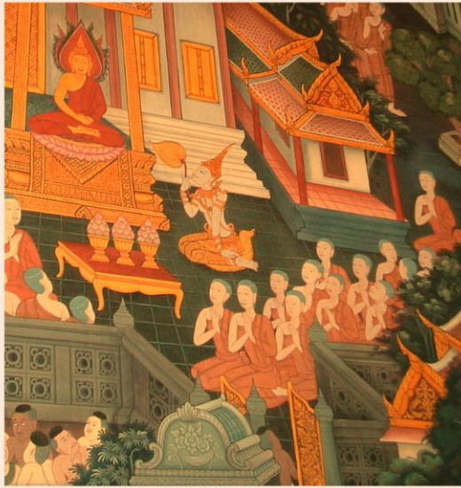
The Thirteen Great Arahant Bhikkhuni Disciples, mural in Wat Pho, Bangkok, Thailand

The Buddha extolled the attainments of the many enlightened bhikkhunis in his Assembly. As the Buddha had two chief male disciples, Sariputta and Moggallana, he likewise had two foremost female monks, bhikkhunis, Uppalavanna and Khema. The presence and accomplishments of bhikkhunis made his Sasana established and his purpose in teaching complete. Bhikkhuni Khema was renowned for her teaching ability. (See the Khema Sutta, SN 44.1)