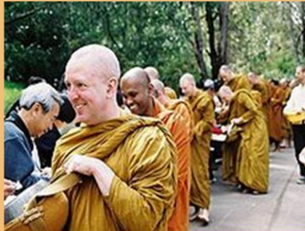
Ajahn Brahm and other monks