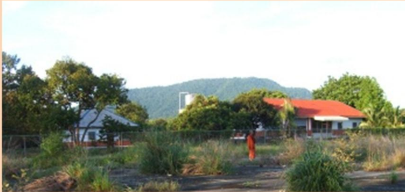
International Women's Meditation Center, Rayong, Thailand

Helped support bhikkhuni centers in Thailand. The land and two buildings were donated by a Thai-American woman. Planning and construction are currently underway. The Bhikkhunis opened the Center for individual and group meditation practice in September of 2009.