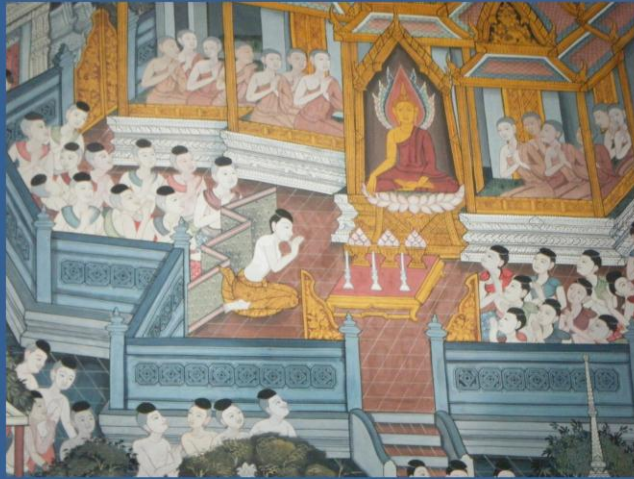
Mural of Fourfold Assembly at Wat Pho, Bangkok, Thailand

The bhikkhunis are to the right of the Buddha. Below them are the upasikas, female lay practitioners. Left of the Buddha are bhikkhus. Beneath them are the upasaka, male lay practitioners. This quote is taken from the Mahaparanibbana Sutta.