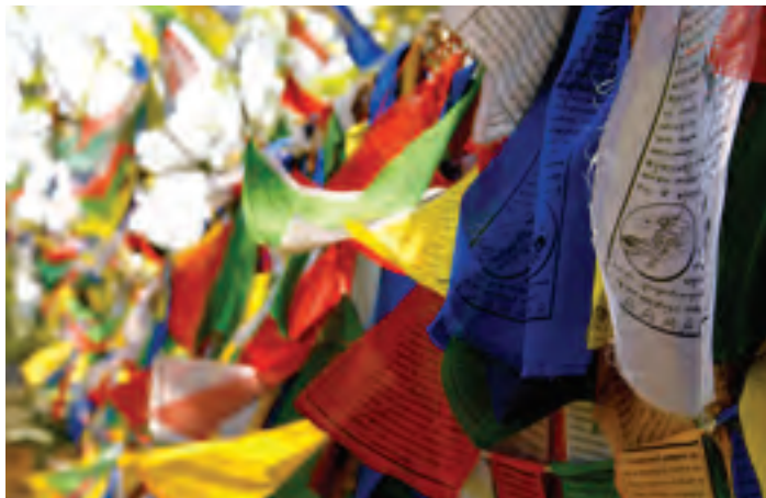
Tibetan prayer flags

Fortunately, the story does not end here. During the