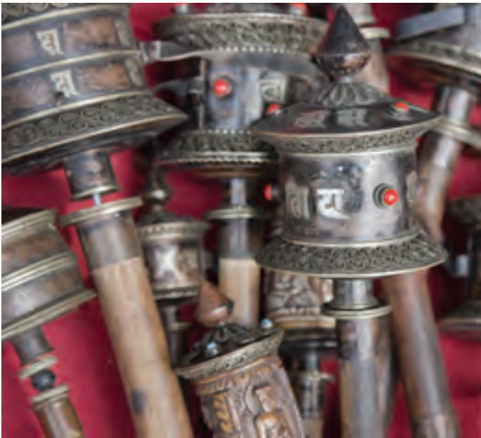
Tibetan prayer wheels